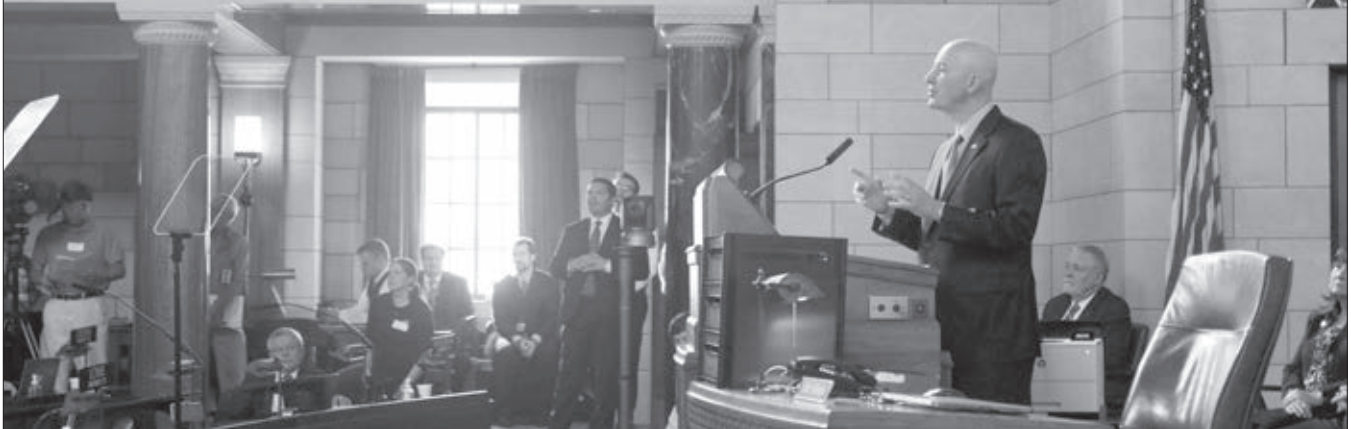
Gov. Pete Ricketts gave his State of the State address in the legislative chamber Jan. 12.

With an emphasis on growing Nebraska, Gov. Pete Ricketts proposed providing property and income tax relief, increasing government efficiency and easing burdensome regulations in his State of the State address to lawmakers Jan. 12.