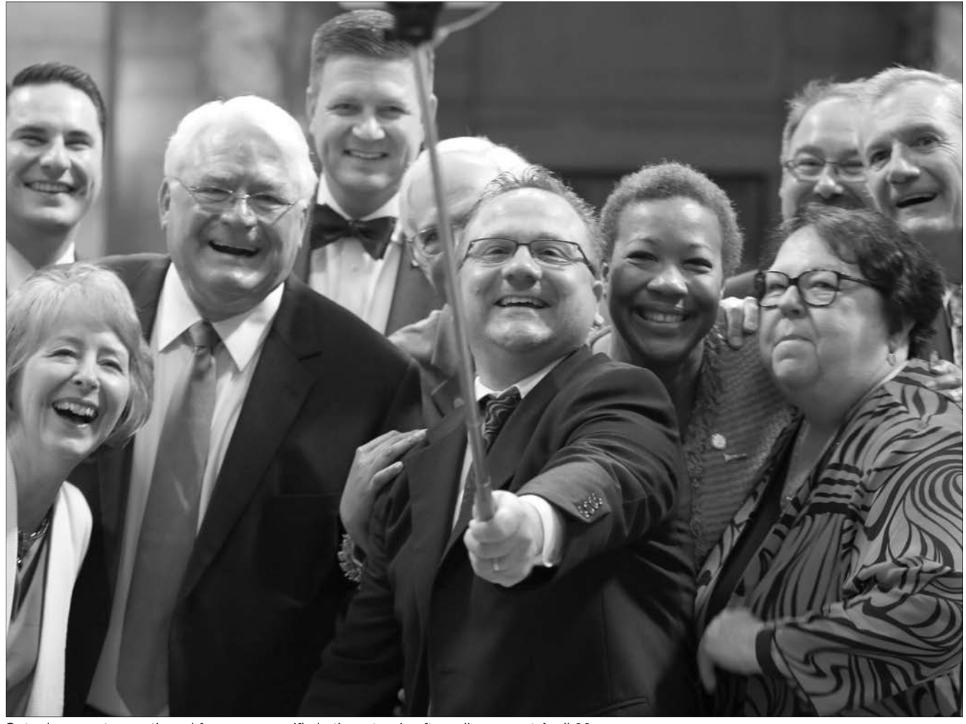
Outgoing senators gathered for a group selfie in the rotunda after adjournment April 20.

PRESRT STD U.S. POSTAGE PAID LINCOLN, NE PERMIT NO. 212