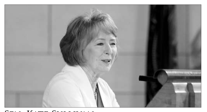
SEN. KATE SULLIVAN

"I learned to work for the greater good—not to seek out the spotlight but to work with whomever was serious and willing to write good legislation."