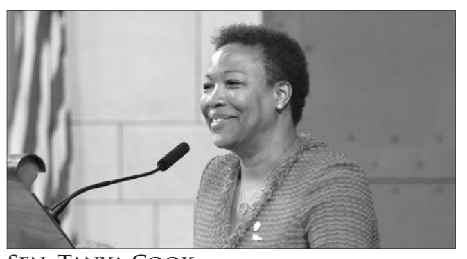
SEN. TANYA COOK

"Those who seek this job are some of the best people Nebraska has to offer. I count it among the greatest privileges to serve along such great people, for we have made a difference."