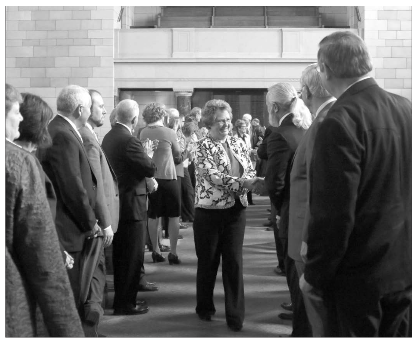
Former senators were invited to the Legislature March 16 to be recognized for their service.

PRESRT STD U.S. POSTAGE PAID LINCOLN, NE PERMIT NO. 212