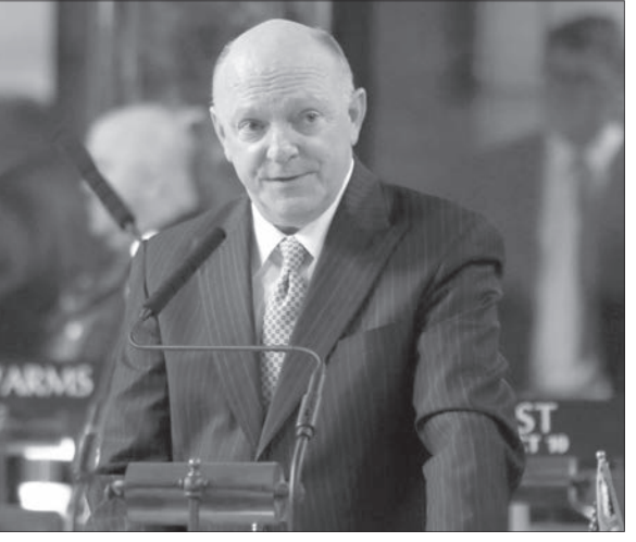
Sen. Jim Smith said the bill would provide funding to complete the state's long-awaited expressway system.

saying that the infusion of funds is necessary to complete long-delayed sections of the state's expressway system, which is critical to economic development in many rural areas.