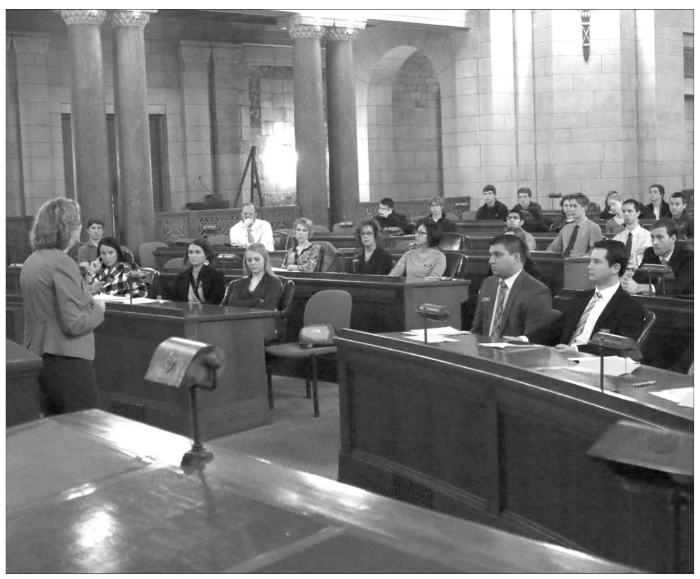
Members of a Hall County leadership group learn about the history and process of the Nebraska Legislature in the historic Warner Chamber.

PRESRT STD U.S. POSTAGE PAID LINCOLN, NE PERMIT NO. 212