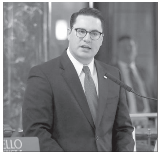
Sen. Heath Mello said that the exemption would promote reinvestment in tourism, the state's third-largest industry.