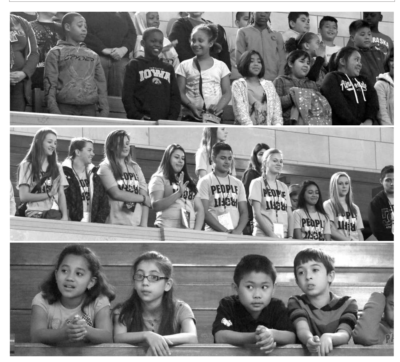
Each year, thousands of students from across Nebraska have the opportunity to visit the State Capitol and observe the Legislature.

PRESRT STD U.S. POSTAGE PAID LINCOLN, NE PERMIT NO. 212