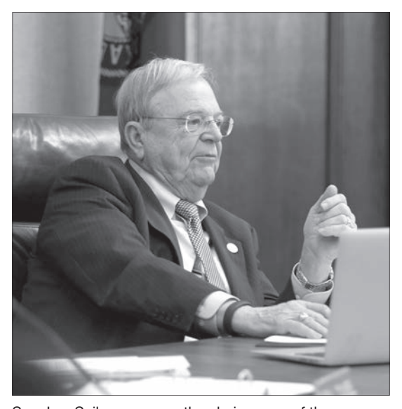
Sen. Les Seiler serves as the chairperson of the Judiciary Committee.

The bill also would remove the mandatory minimum sentence option for habitual criminals. Offenders still