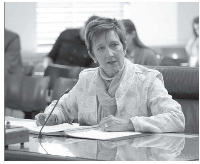
Sen. Patty Pansing Brooks explains LB483, a bill designed to expand the court's sentencing options except in the case of a life sentence.

LB173, also introduced by Chambers, would require that only those convicted of three violent crimes be considered a habitual criminal. All three of an offender's