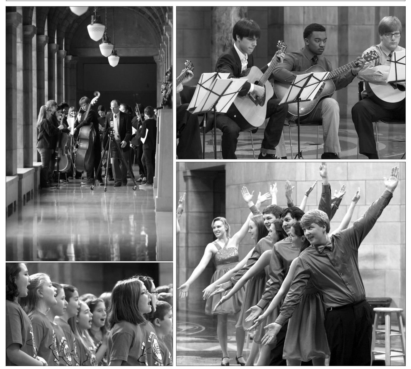
During Music Education Week at the Capitol, students from across the state shared their musical talents while performing in the Rotunda.

PRESRT STD U.S. POSTAGE PAID LINCOLN, NE PERMIT NO. 212