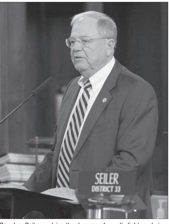
Sen. Les Seiler explains the dangers of novelty lighters during floor debate on LB403.

The bill defines a novelty lighter as a mechanical or electrical device typically used for lighting cigarettes, cigars or pipes and designed to resemble a cartoon character, toy, gun, watch, musical instrument, vehicle, animal, food or beverage container or a similar item that plays musical notes, has flashing lights or has more than one button or function.