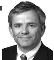
Sen. Steve Lathrop