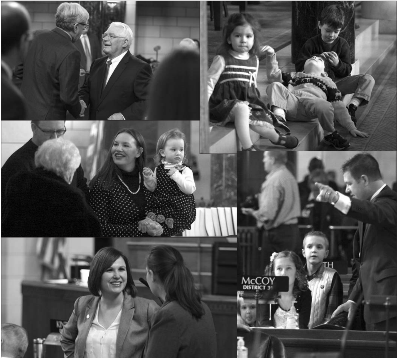
Senators greet their colleagues as family members join them in the Norris Legislative Chamber to observe the opening day of session Jan. 8.

PRESRT STD U.S. POSTAGE PAID LINCOLN, NE PERMIT NO. 212