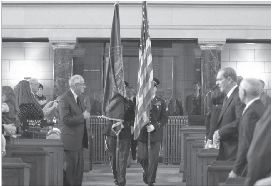
Members of the Nebraska Army National Guard assist in the presentation of colors during the opening ceremonies of the 2014 session.

Gov. Dave Heineman's State of the State address is