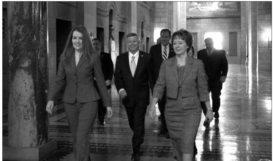
Senators escort Gov. Dave Heineman (center) to the legislative chamber to issue his State of the State address Jan. 15.

Under his two-part budget proposal, the governor called for a modernized tax code that would eliminate either the individual and corporate income taxes or lower rates dramatically