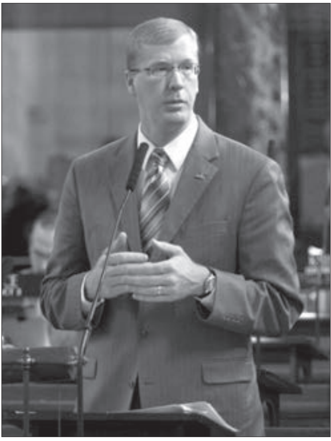
Sen. Chris Langemeier, chairperson of the Natural Resources Committee

egislation clarifying oil pipeline regulations as well as the protection and management of the state's water and wildlife resources was passed this session.