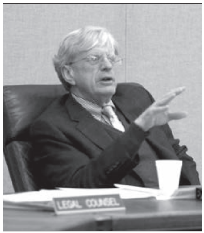
Sen. Brad Ashford, chairperson of the Judiciary Committee

Sion, including continued juvenile justice reform, child abuse penalties and changes to the state's gaming laws.