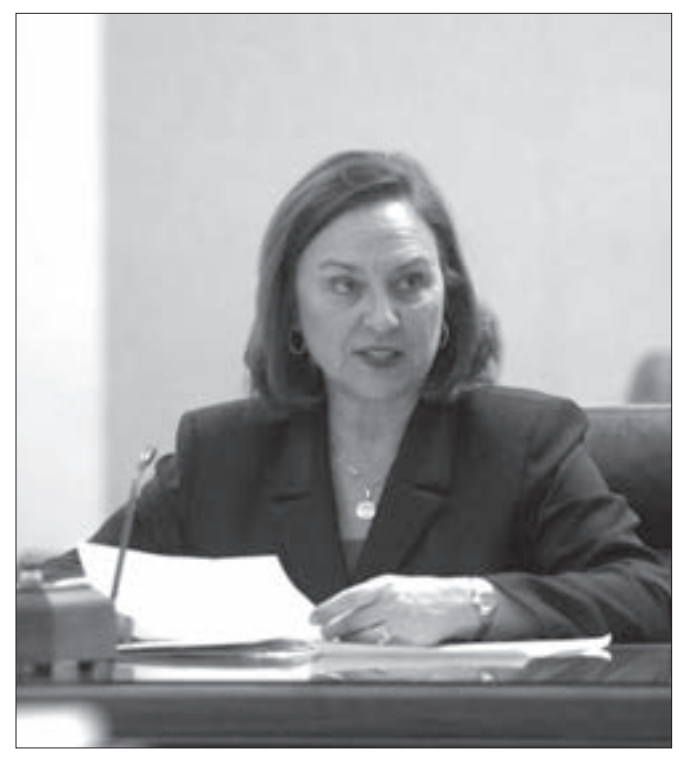
Sen. Deb Fischer, chairperson of the Transportation and Telecommunications Committee

S enators considered and passed legislation addressing a wide range of issues this session, including pedestrian and motor vehicle safety, hauling requirements and specialty license plates.